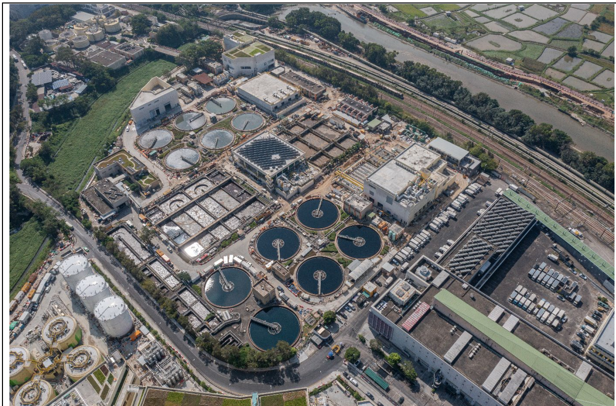
Description: Aerial Photo in Portion A & Portion B on 13 November 2025