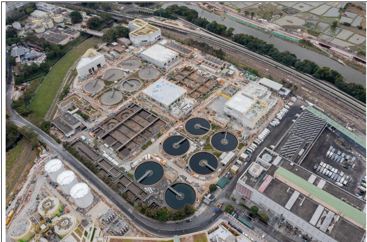
Description: Aerial Photo in Portion A & Portion B on 15 January 2025