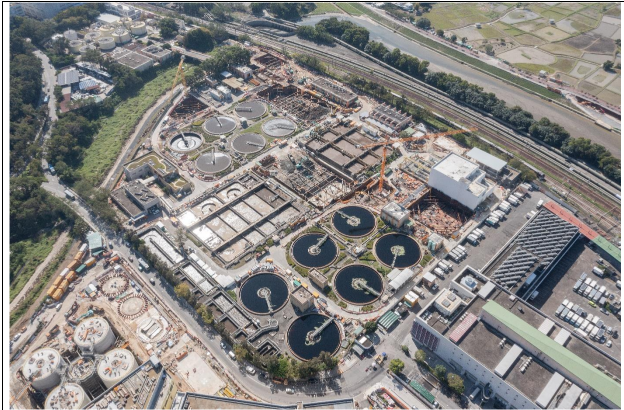
Description: Aerial Photo No. 1 in Portion A & Portion B on 19 December 2022